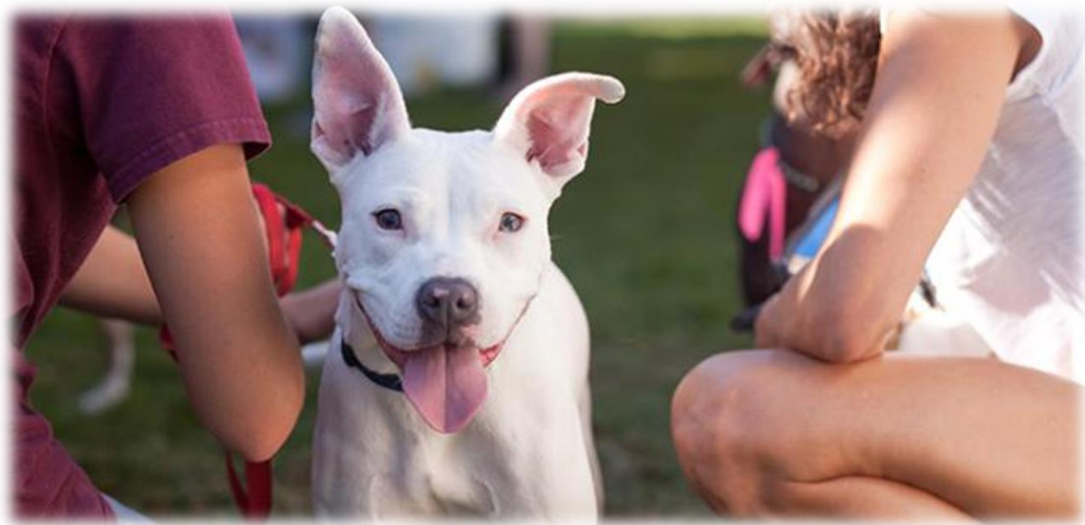
Best Friends Animal Society

What changes have you seen in employee giving? How do you see it evolving?