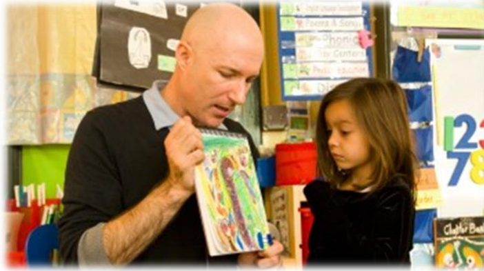
Southern Poverty Law Center