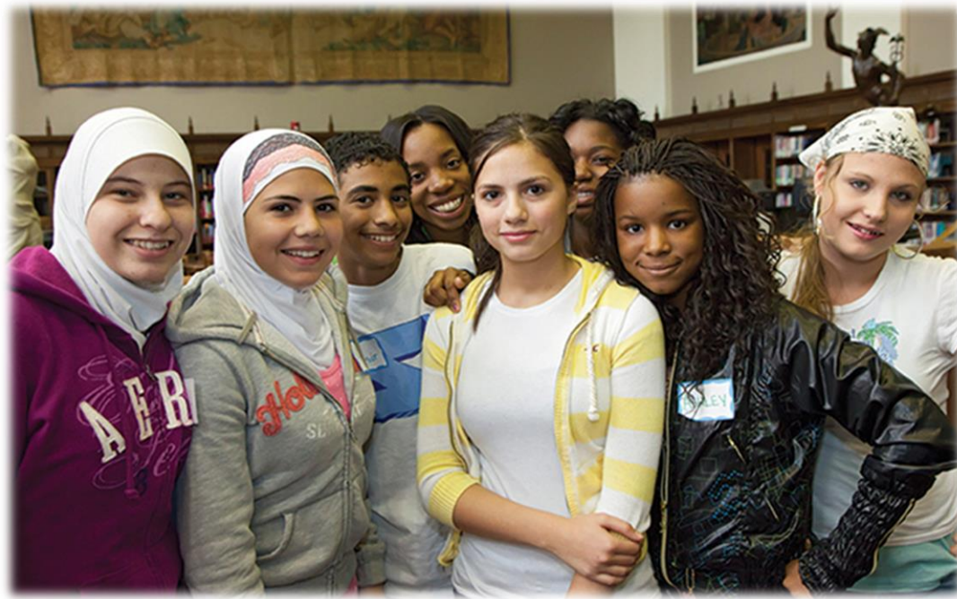
Southern Poverty Law Center